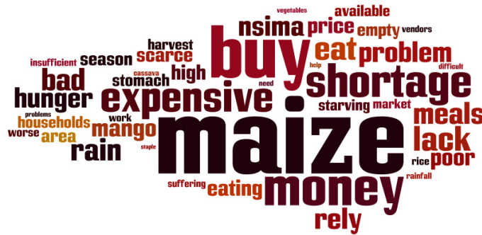
Fig. 2. Word Cloud from open-ended question to households in Malawi